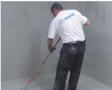
Mapelastic Foundation spread on by roller to waterproof against water in negative pressure