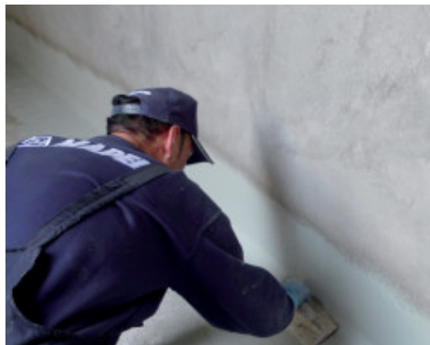
Mapelastic Foundation spread on by trowel to waterproof against water in negative pressure