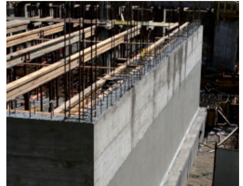
Retaining wall waterproofed after casting using Mapelastic Foundation