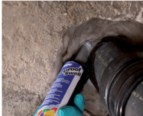
Through element sealed using Mapeproof Swell