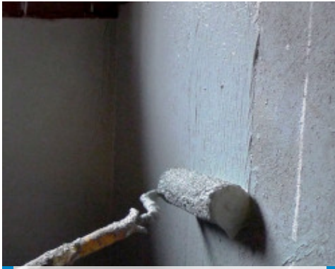
Application of Mapelastic Foundation by roller on a substrate evened out using Planitop HDM Maxi

Mapelastic Foundation may also be applied by spray using a rendering machine with a smoothing and finishing lance with a nozzle up to 10 mm diameter, and an air compressor with a capacity of at least 800 l/min. The final thickness must be at least 2 mm. After applying the first layer, wait until it has cured (approximately 6 hours) and then apply a second layer. If there is water under negative pressure, finish off the surface of each coat with a trowel to form an even, well sealed layer. For water under positive pressure, we recommend finishing off at least the first coat with a trowel.